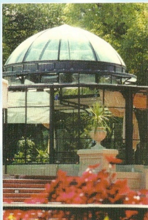
CUPULE OF HOTEL DEL PRADO, URUGUAY

Glasslam's, innovative technology allows for unlimited flexibility in the production of laminated glass products. Using this technology, Glasslam fabricators can produce bent glass in any size and shape with assured quality.