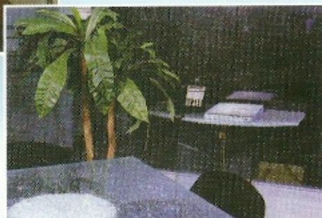
GLASSLAM N.G.I., INC. HEADQUARTERS CONFERENCE ROOM POMPANO BEACH, FLORIDA, USA