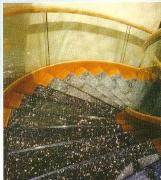
CRACKED ICE STAIRCASE, PRIVATE RESIDENCE, LONG ISLAND, NEW YORK, USA