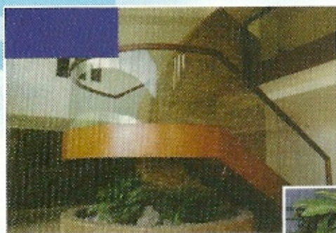
BENT GLASS STAIRCASE, PRIVATE RESIDENT, VENEZUELA

Cracked Ice is uniquely available to the Glasslam customer. This style is easily produced by laminating tempered glass in between two lites of annealed glass. After laminating, the center lite of tempered glass is broken. This eye pleasing product offers a customized touch of elegance to any home or office. Each piece holds its own characteristics, no two are alike, giving it a one of a kind appeal. Cracked Ice can be produced in a range of colors, again, customized to the end user's taste and preference. This product is ideal for use in tables, shelving, bars, shower doors, and many other interior decorating features.