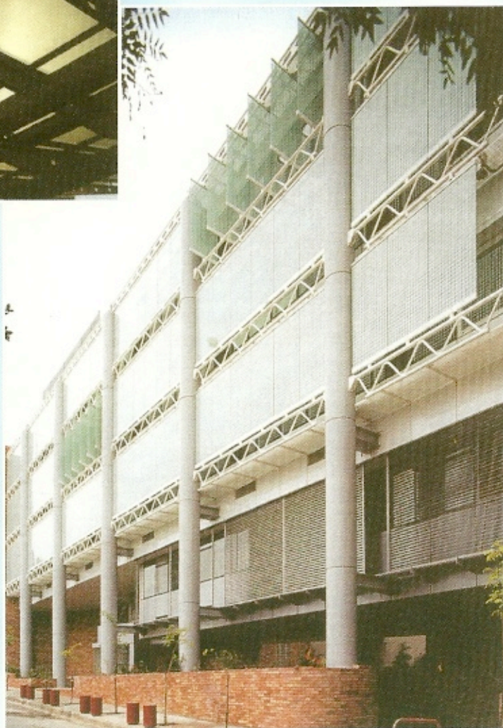
EUROPEAN UNION BUILDING, ATHENS, GREECE

Sand-Seal can also be produced in any desired color. Sand-Seal comes in translucent white as standard and a range of colors are available to give the effect of stained glass. A three dimensional effect can also be produced by sand blasting both pieces of the glass to be laminated. With the range of colors and the designer's talent, the design capabilities are endless when using the combination of Sand-Seal and the Glasslam laminating system.